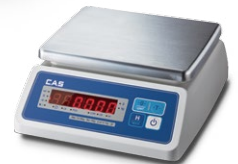
► SWII-W (LED)

Compact Design and easy to use, suitable for wet environments where light weight & portable scales are needed.