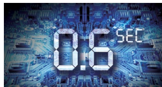
Fast operation and High accuracy