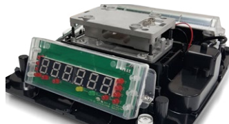
Sealed & Protected PCB