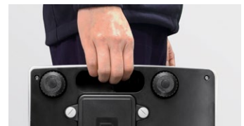
Convenient to carry