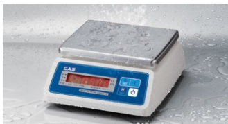
Suitable for wet environment