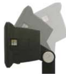
Tilting indicator bracket