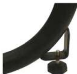
Additional pole-support foot