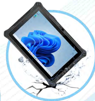
Rugged Design (1.22m Drop Test IP65 Whole Unit)