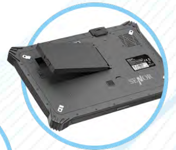
Hot Swap Battery