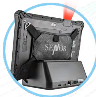
2D Scanner & Comprehensive Charging Dock*